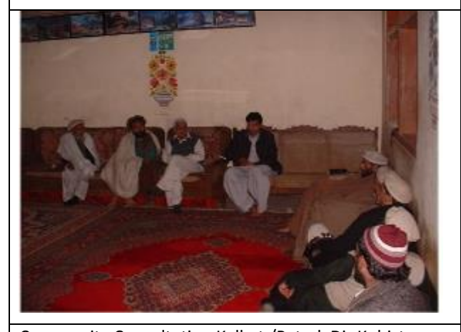
Community Consultation Kalkot /Patrak Dir Kohistan