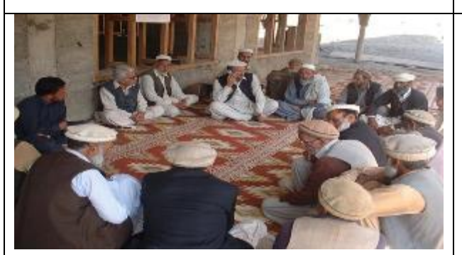
Community Consultation at Barikot, Dir Kohistan