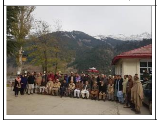
RPF and ESMF Disclosure at Dir on November 9, 2019